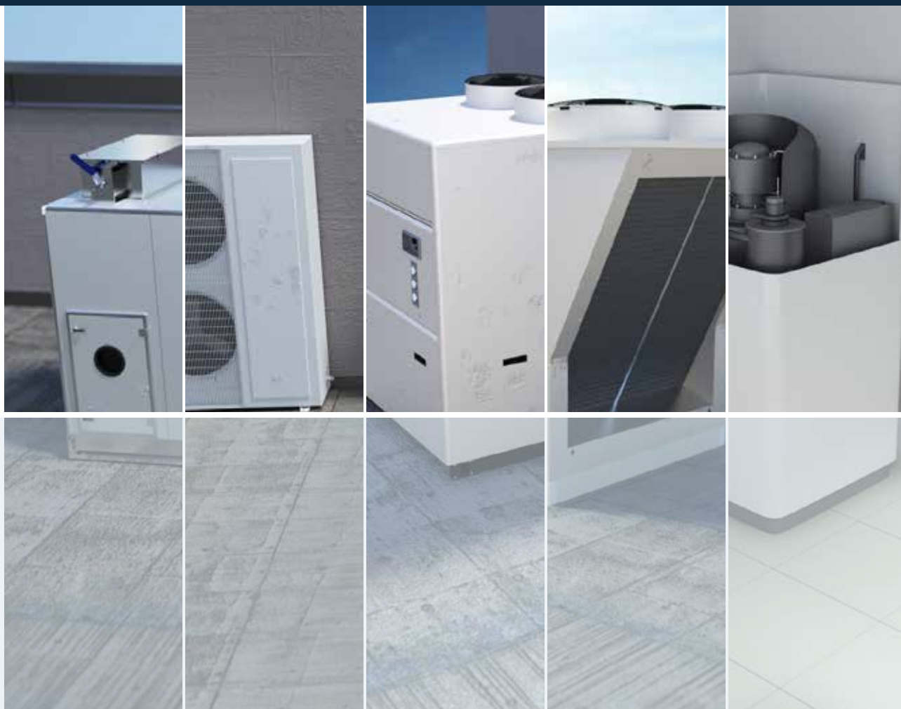
Air handling units