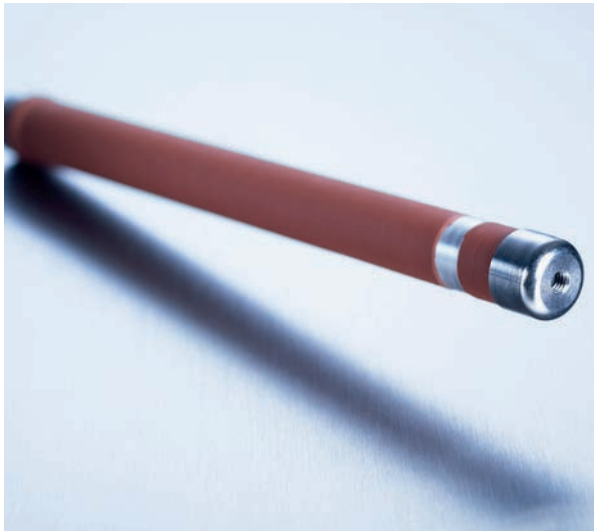
Figure 1: MTX type high-voltage resistor (divider)